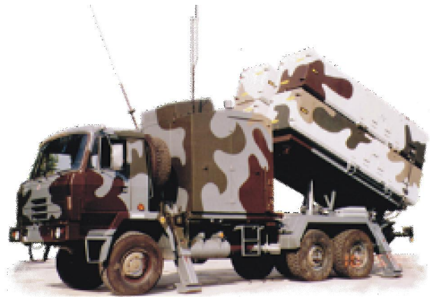
Coastal mobile launcher