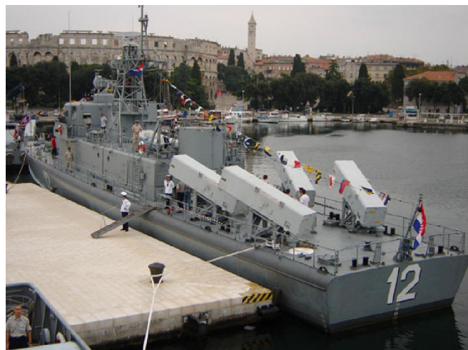
The Fast Missile Corvette RTOP-12